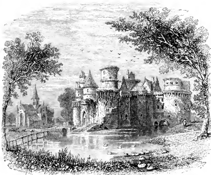
THE CASTLE OF VILVORDE.